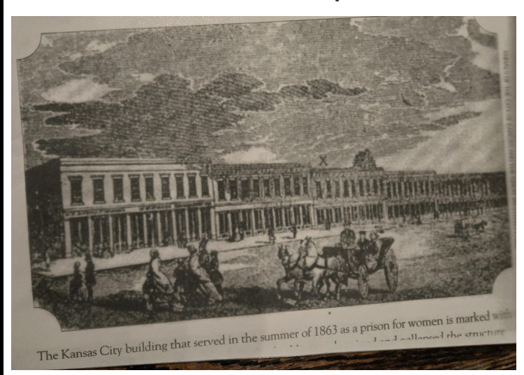
There's an X above the jail building that collapsed.